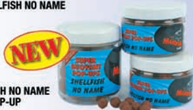
NEW SHELLFISH NO NAME POP-UP