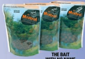
THE BAIT WITH NO NAME