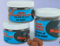
NEW THE POP-UP WITH NO NAME