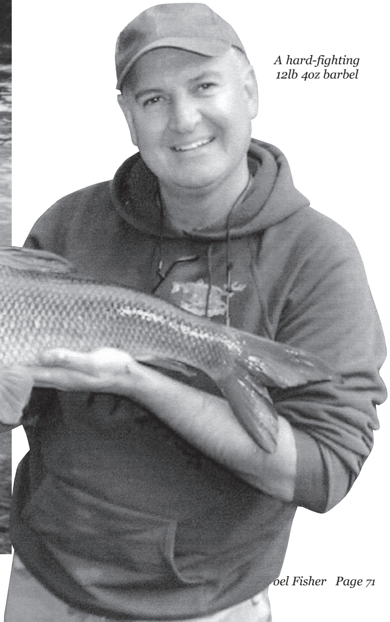
A hard-fighting 12lb 4oz barbel