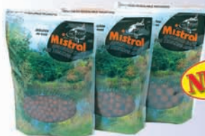
SHELLFISH NO NAME