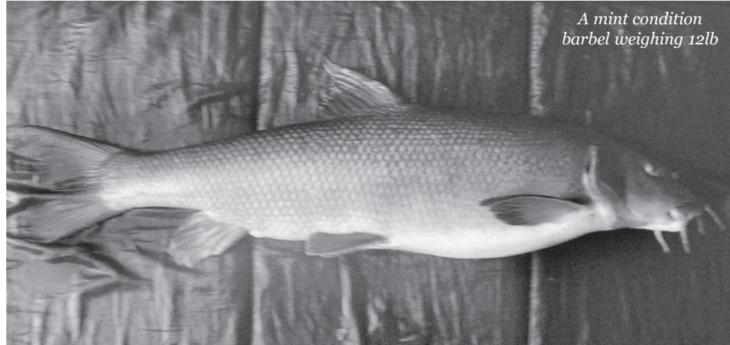
A mint condition barbel weighing 12lb

In the afternoon of the 25 September my rod pulled round nearly coming off the rest and I hooked into a mint