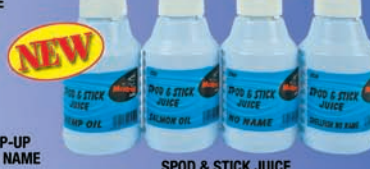
SPOD & STICK JUICE