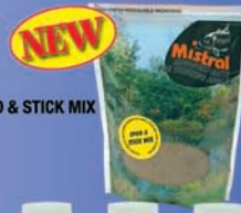
NEW SPOD & STICK MIX